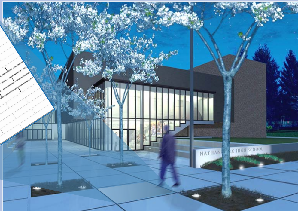
Illustration by Mablum Achitects

Entry Courtyard Engravings: $50.00 for 0 to 30 characters $75.00 for 36 to 45 characters.